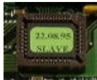
Software for motor controller

This card controls the stepper motor output cards via the backplane of the motor card rack