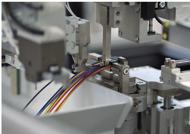
Insertionhead with integrated force measurement

The Zeta 633/651 fully automatic loader can be combined optionally with a standard Zeta bundler. This combination gives the customer full flexibility. Now both processing possibilities are always available, block loading and cable bundling on one and the same machine without changeover.