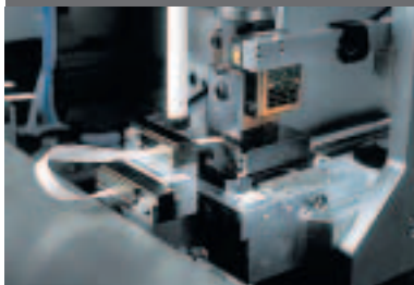
V-forming of conductor tracks in preparation for subsequent crimping