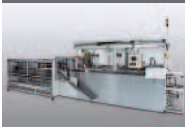
Fully automatic Lambda 9100 for flexible flat cables