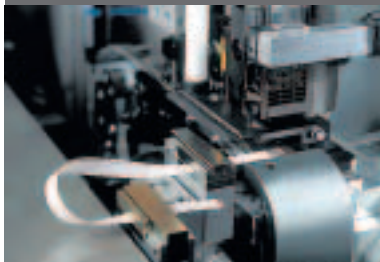
Conductor track crimping with integrated crimp force analyzer CFA